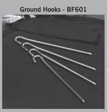
Each Pop Out set comes with 4 ground hooks that are stored in the Carrying Case.