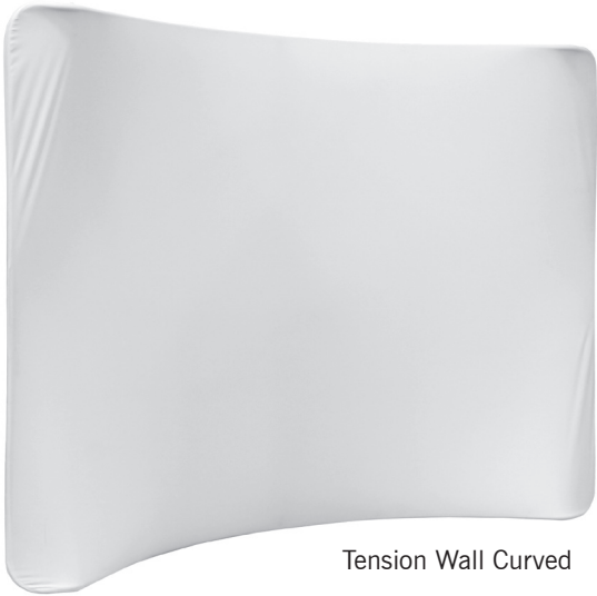
Tension Wall Curved